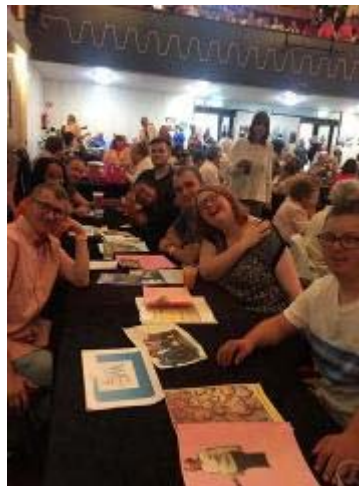
The group all had a great evening out!