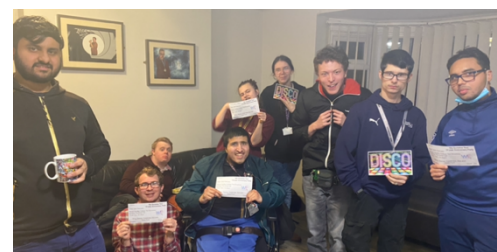
Members of We Socialise Too! promoting the disco

As part of a schedule of ideas to celebrate the clubs longevity the first event took place as a Disco during February half term . Members of the club planned and organised the event which was open to family and friends as well as Dudley College students. Everyone that attended had a fantastic time. The club plans for many more activities over the rest of the year